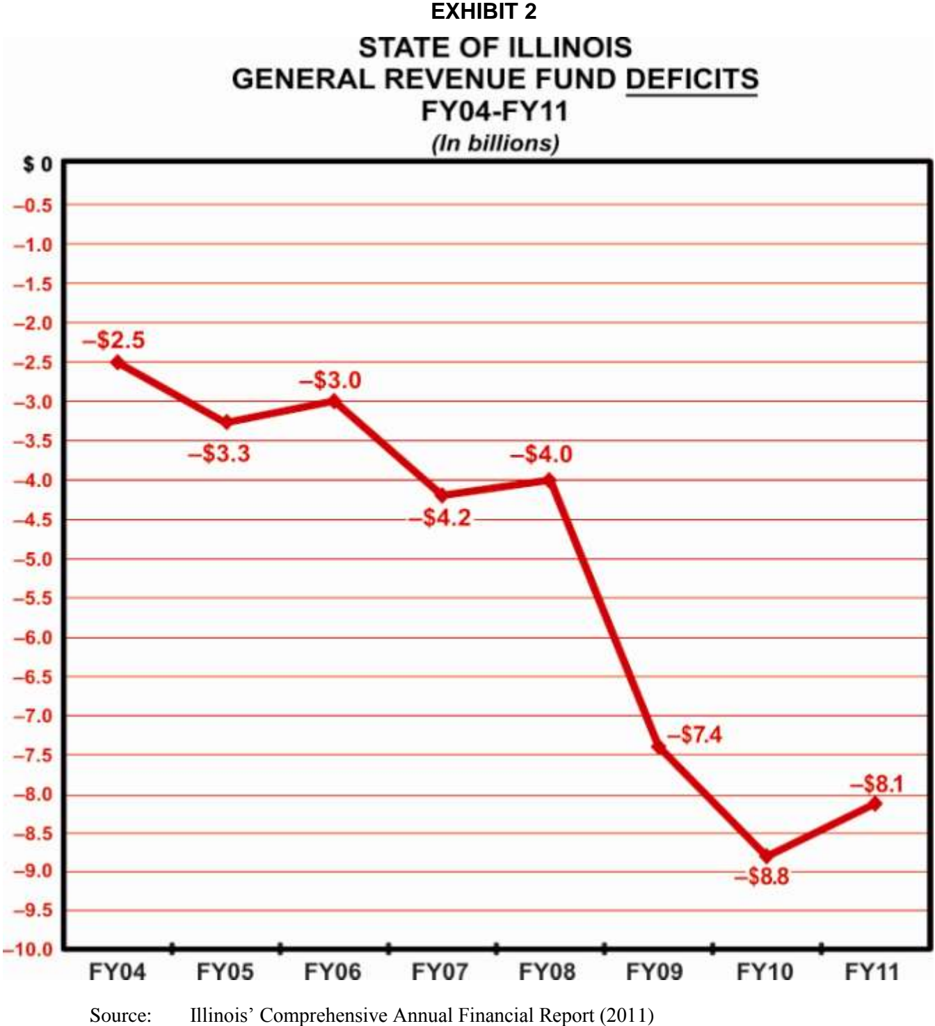
Numbers reflect restatements.

Many programs are accounted for in the General Fund. The GAAP basis financial position of the General Revenue Fund <u>deficit</u> decreased at June 30, 2011 from June 30, 2010. The fund balance deficit in the State's General Revenue Fund decreased by $738 million on a GAAP basis (from a deficit of $8.818 billion, as restated, to a deficit of $8.080 billion). Exhibit 2 reflects the General Revenue Fund deficit for fiscal years 2004 through 2011.